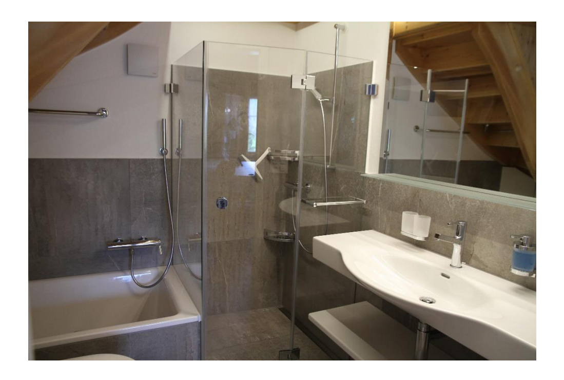
Hairdryer Radiator for towels