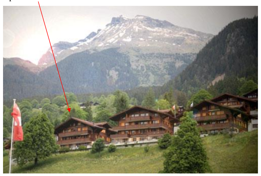
The apartment is on the top floor with fantastic view to Eiger, Männlichen, Kleine Scheidegg and Lauberhorn

The Chalet Perle is based on a quiet place, near the access road to Grindelwald Village, 600 meters from the main train station and 800 meters from the Sport Center.